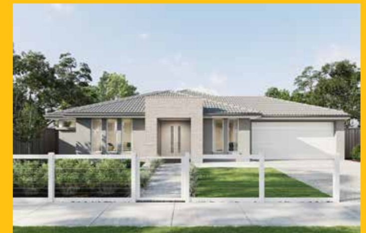
D: Cable Railings