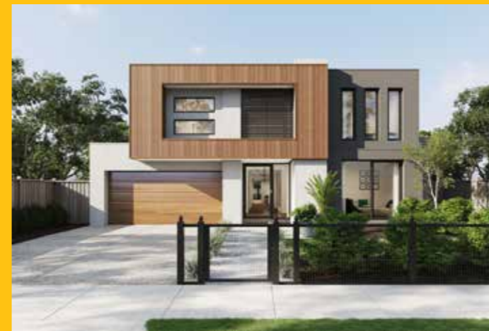
A: Heritage Woven Wire