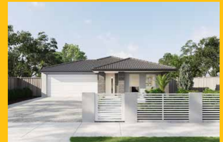
B: Contemporary Pillar