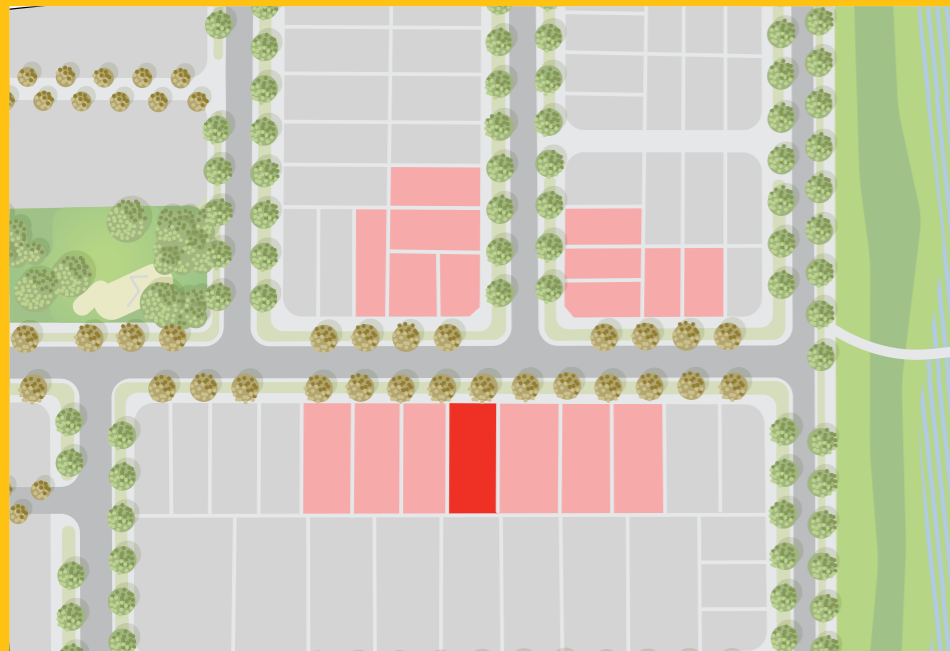
Example 3 houses separation

A dwelling must avoid replicating an identical or overly similar façade of a dwelling within 3 lots in either direction on the same side of the street, or within 3 lots on the opposite side of the street.