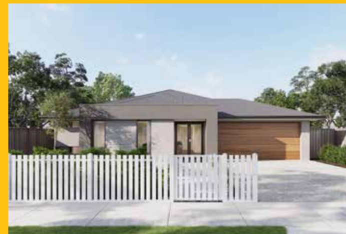
C: Flat Top Picket Fence