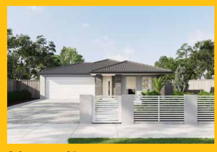
B: Contemporary Pillar