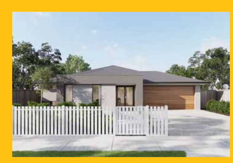
C: Flat Top Picket Fence