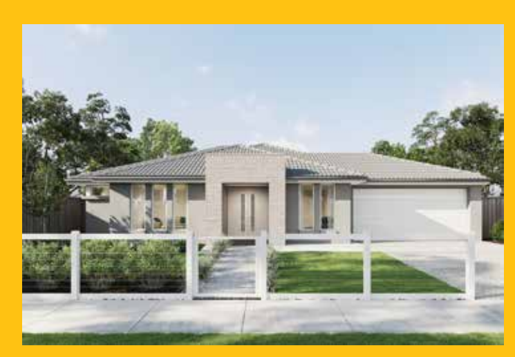
D: Cable Railings