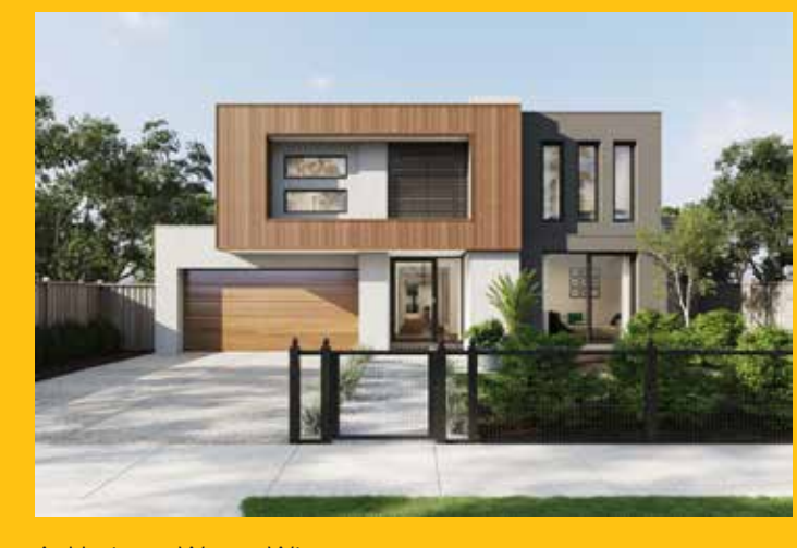
A: Heritage Woven Wire